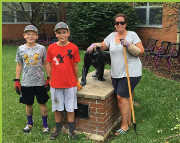
Thank you Maumee Garden Club for beautifying the Courtyard at Maumee High School.

Join a Booster Club. Not everyone who participates in booster clubs is a parent. The Maumee Athletic Boosters is the prime example. Community members who had children in school years