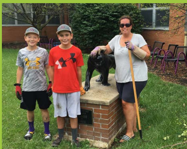
Thank you Maumee Garden Club for beautifying the Courtyard at Maumee High School.

Join a Booster Club. Not everyone who participates in booster clubs is a parent. The Maumee Athletic Boosters is the prime example. Community members who had children in school years